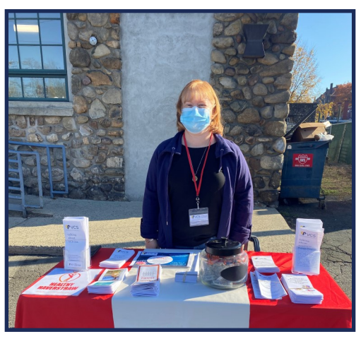
Healthy Haverstraw in November