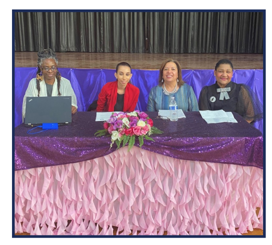
International Women's Day in March